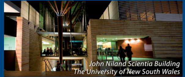
John Niland Scientia Building The University of New South Wales

The Go8 offers a trusted network through which ideas and expertise are shared. Various committees of Go8 directors meet regularly to share information and ideas and to work jointly on projects.