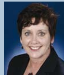
Senator the Hon Ursula Stephens Parliamentary Secretary for Social Inclusion and the Voluntary Sector

Attendance is by invitation only. Senator the Hon Ursula Stephens, Parliamentary Secretary for Social Inclusion, will officially open the forum. Full program and further information available at www.go8.edu.au .