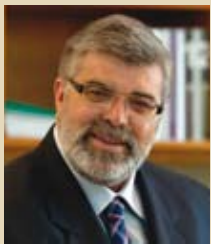
Senator the Hon Kim Carr Minister for Innovation, Industry, Science & Research

Attendance is by invitation only. Senator The Hon Kim Carr will officially open the symposium. Full program and further information available at www.go8.edu.au .